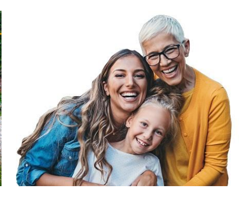
Family 5 Family 6 Family 7