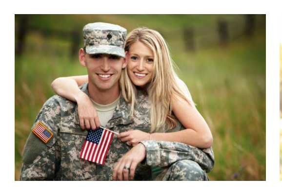
Military Couple 1