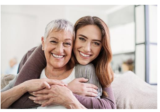
Grandmother Granddaughter 1